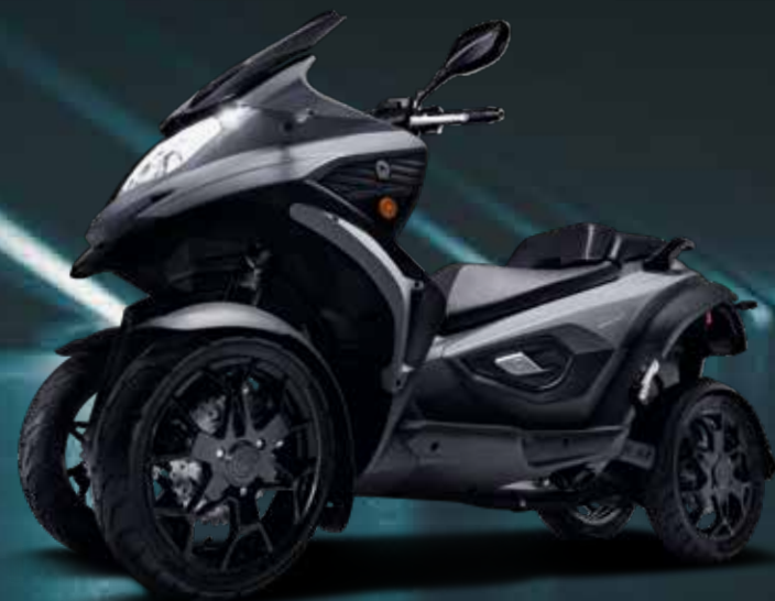
TITANIUM GREY (MATT)