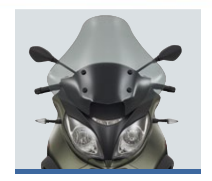
SMOKED WINDSCREEN WITH INTEGRATED HAND GUARDS