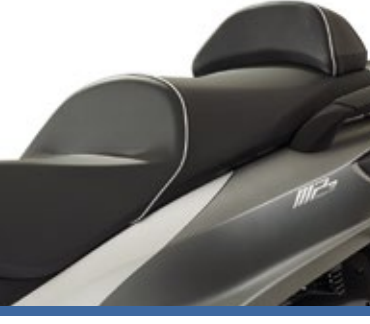
NEW ERGONOMIC SEAT