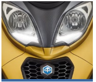
NEW LED HEADLIGHTS WITH DRL

colour schemes with four matt shades, Grigio Elemento, Oro, Blu Nettuno and Nero Meteora are all elements exclusive to this model.