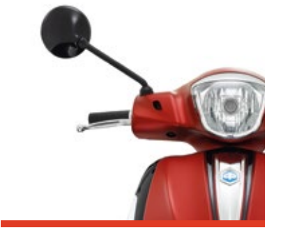
BLACK REAR VIEW MIRRORS