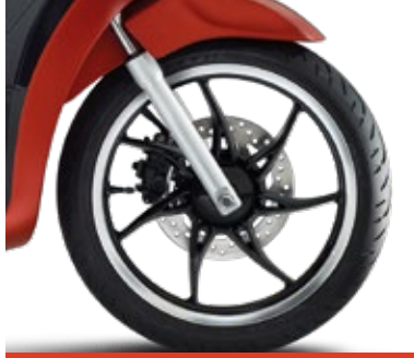
BLACK DIAMOND WHEEL RIMS

The "S" version expresses all the energy of your personality and dynamism of your daily life. Details that set the style tone: the saddle with exclusive finishes, the diamond-edged wheel rims and the black rear view mirrors. 3 engines are available: 50, 125 and 150 with front wheel ABS, with a Matte Titanium Grey or Matte Red livery so that you can stand out with a touch of style.