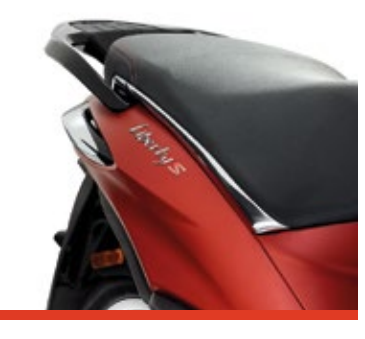
BLACK REAR GRAB HANDLE