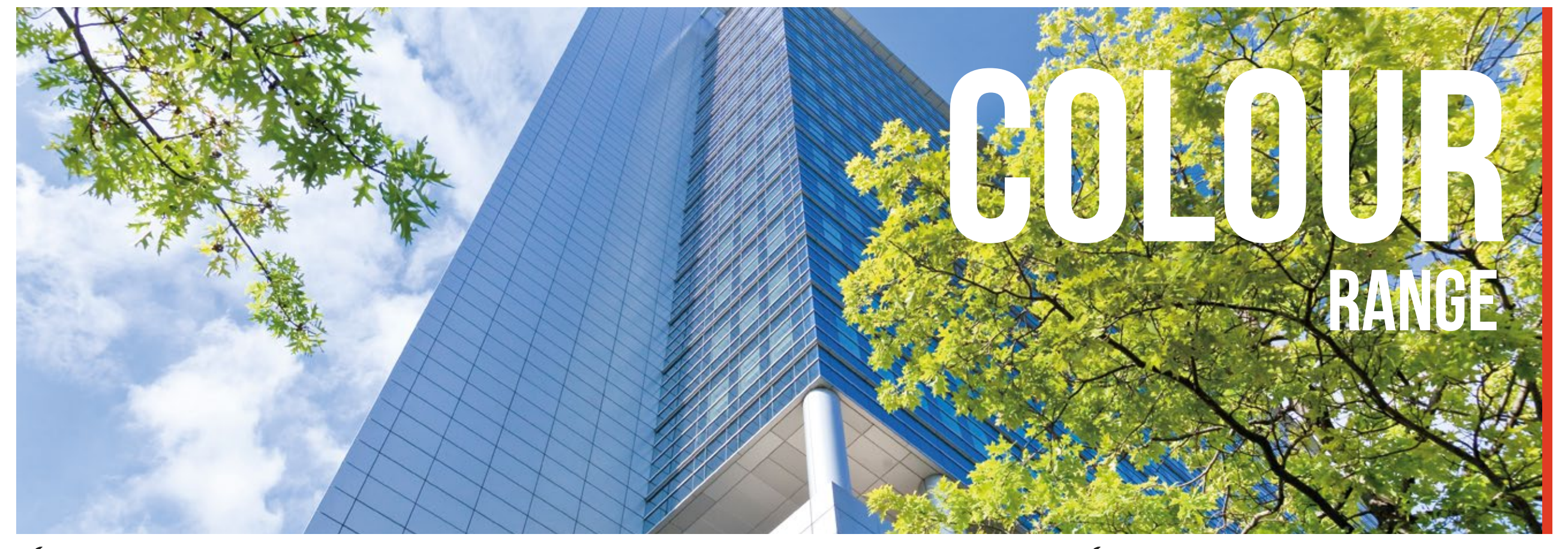
Liberty 50 i-get | 125 i-get ABS | 150 i-get ABS